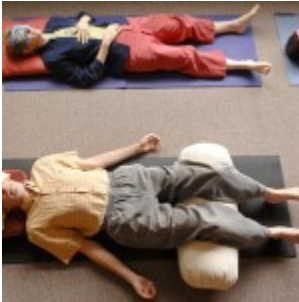
Yoga Nidra Practice

Yoga Nidra is a powerful relaxation and meditation technique derived from ancient tantra and developed by Swami Satyananda of the Bihar School of Yoga. This technique induces deep body-mind relaxation with the ultimate goal of increasing self-awareness.